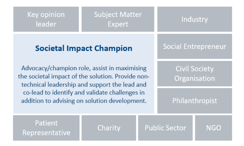
Figure 1. The Societal Impact Champion will play a key advocacy/advisory role and can be drawn from a range of areas.

academia and have appropriate experience in areas relevant to the societal impact focus of the application. These areas could include, for example: public sector/government, charities, patient advocacy, philanthropy or civil society. As a member of the core team, the Societal Impact Champion will play an important leadership role bringing complementary non-technical skills and stakeholder/beneficiary perspectives. In particular, the Societal Impact Champion will lead in the identification of barriers and in the development of strategies to overcome them.